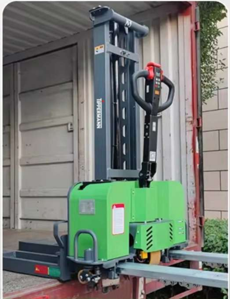
Empty car with car